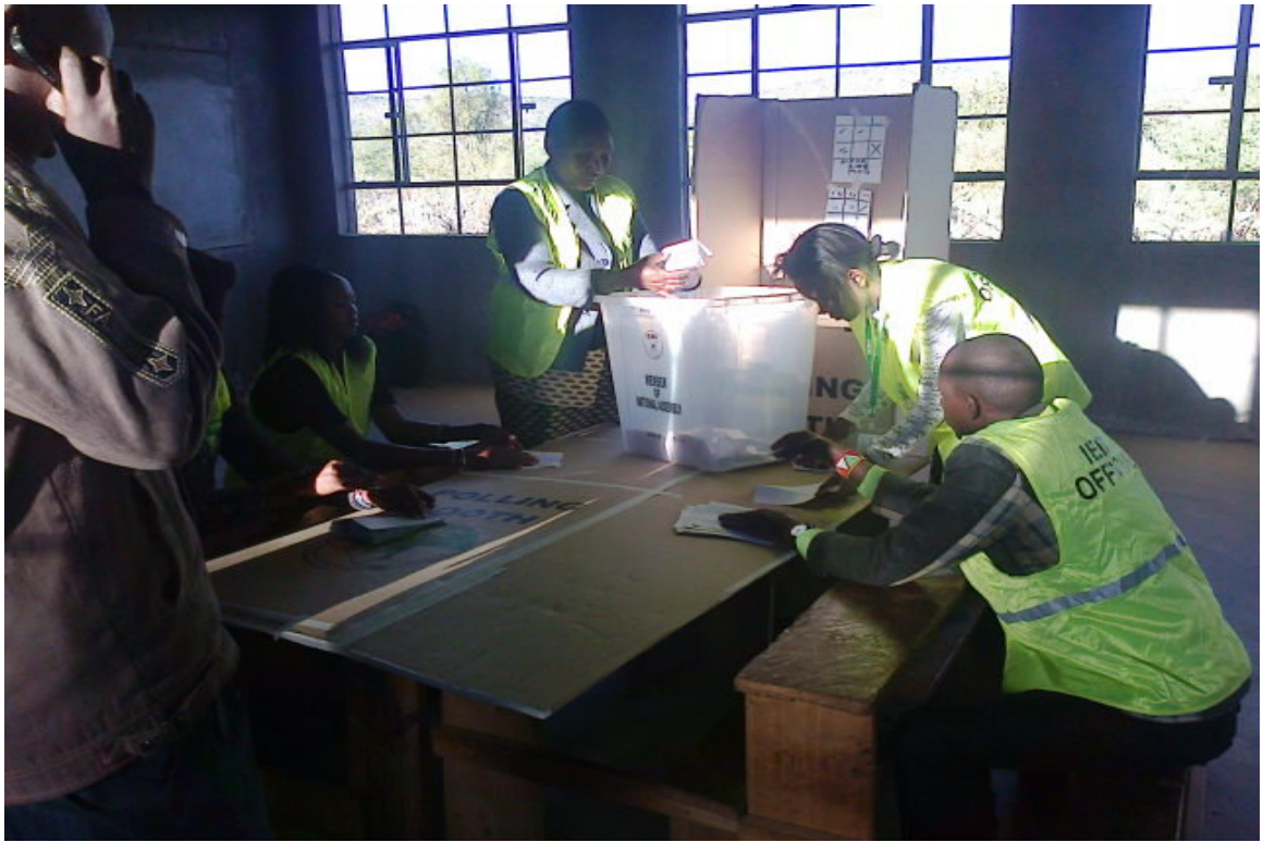
Photograph 3. Presiding Officer, Ilparua Primary school polling station sorting votes assisted by other election officials during counting.