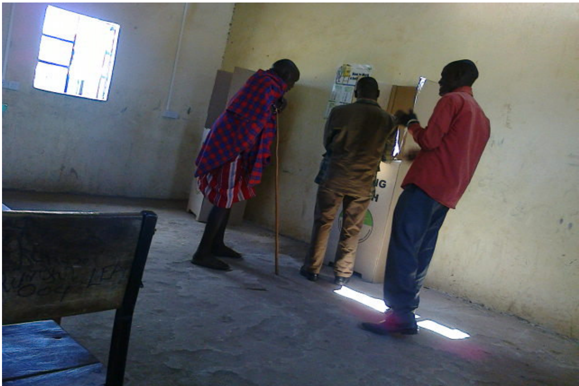
Photograph 2: Presiding Officer, Olmanie Primary School polling station assisting a voter to mark a ballot paper.