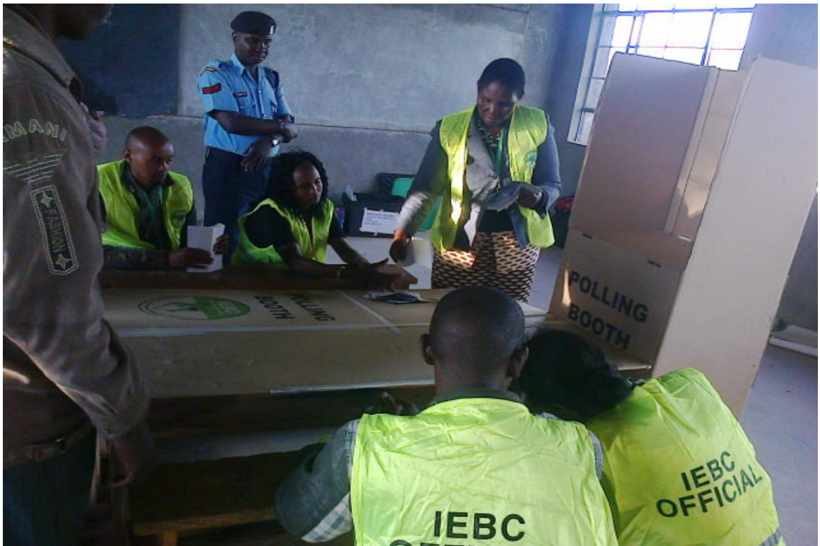
Photograph 4: Election officials counting votes at Ilparua primary school polling station.