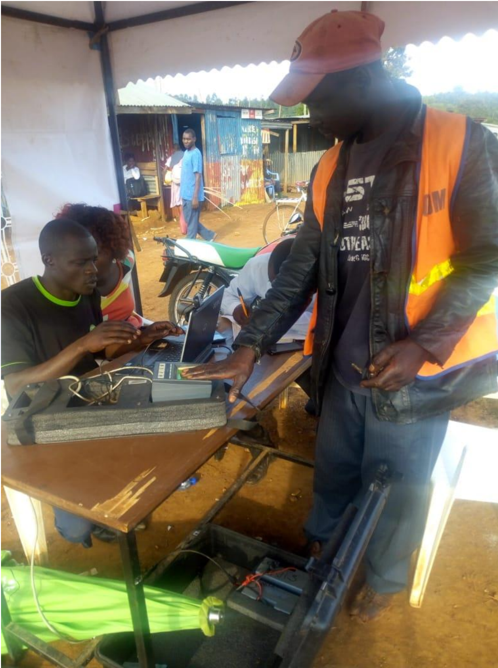
PHOTO 2: A new voter's details and biometrics are captured in real time during the education exercise. This particular session enlisted five new voters into the register.