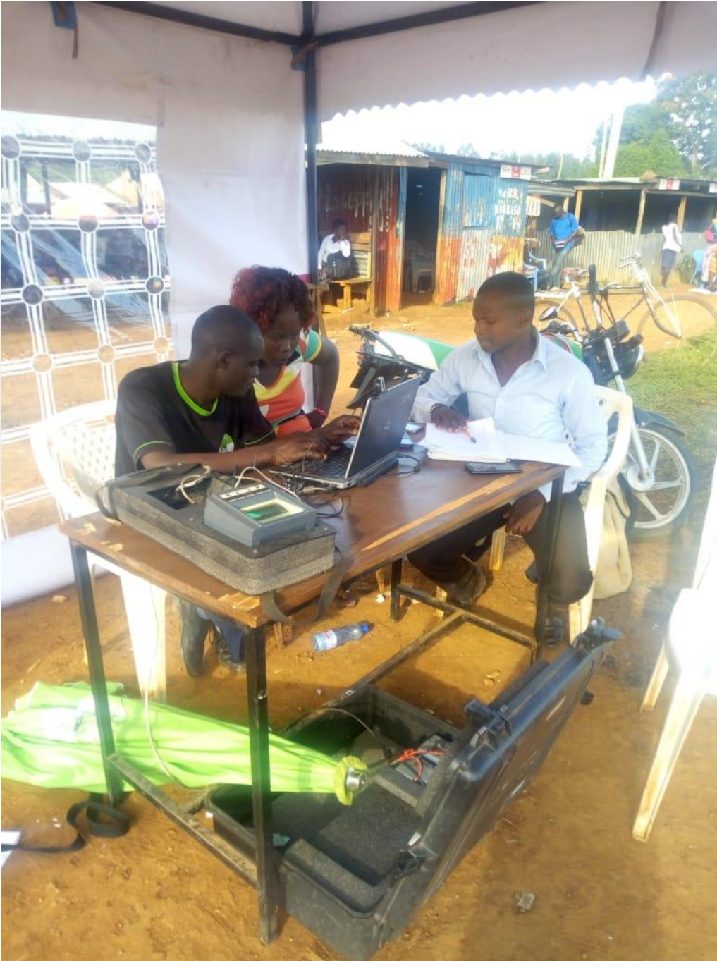
PHOTO 1: IEBC registration clerks seconded by the Gem Constituency Coordinator's Office, assist a voter transfer his voting center to Gem Constituency during our exercise.