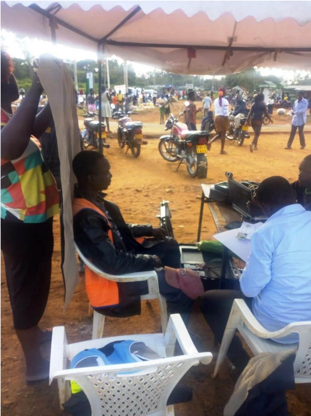
PHOTO 3: A participant during our exercise has his photograph taken, the location of this activity to fall on a market day ensured a large section of the population was reached.